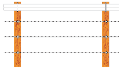
Flex Topline with 3 Strands of Electric Braid

Different combinations can work in different areas. For example, choose three or four rails of oak or Flex along the road for aesthetics, four strands of electric braid along the back tree lines, and four strands of electric braid with a Flex or oak topline for visibility by the barn.