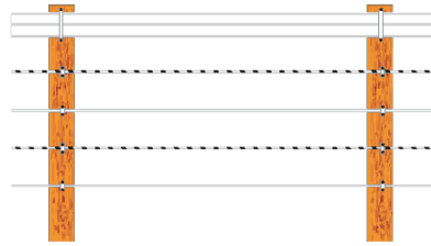
Flex Topline with 2 Strands of Electric Braid & 2 Strands of Coated Wire