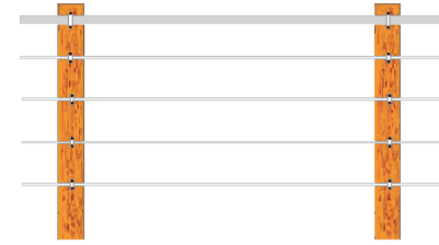
1.5" Electric Tape Topline with 4 Strands of Coated Wire