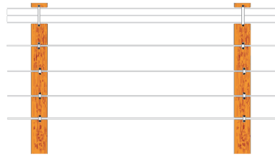
Flex Topline with 4 Strands of Coated Wire