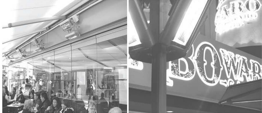
SOLAIRA ALPHA GROUPED INSTALLATION TABLE

NOTE: 240V Heaters can be installed on 208V service with total output de-rated by approximately 25%