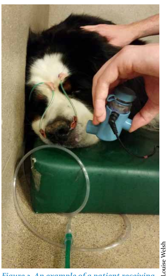
Figure 2. An example of a patient receiving nebulisation through the Flexineb Small Animal nebuliser.