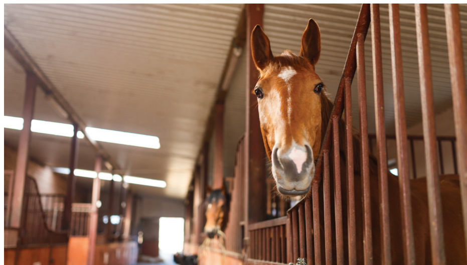
Owners should understand the importance of air quality, particularly in indoor barns

use with meter-dosed inhalers (MDIs). This allows a targeted, fine mist of an aerosolised drug to be administered to the horse. The nebuliser is also portable and easy to set up with no hoses, cords or valves, meaning it can be used in the stable itself.