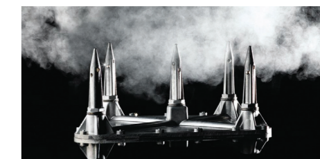
HAYGAIN patented spiked technology

To effectively reduce respirable dust, remove all mould and significantly reduce bacteria concentrations, it is essential to ensure that high-temperature steam