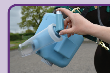
Also compatible with MDI's

Viscosity of liquids, volume of medication prescribed and environmental temperature are all factors that contribute to how well vibrating mesh technologies operate. Other technologies, including Flexineb 1, cannot react actively/during a treatment