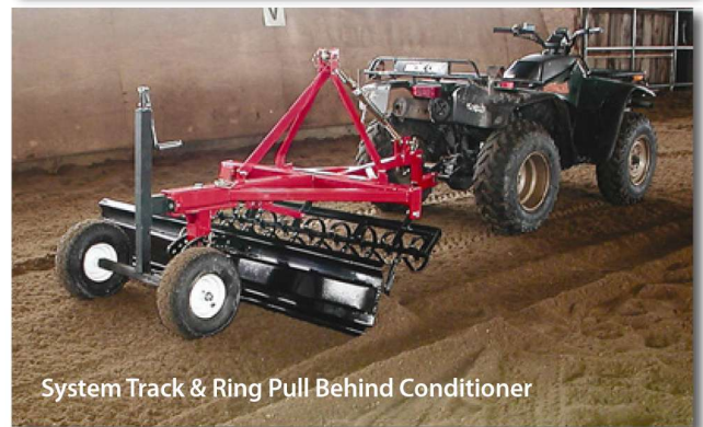
System Track & Ring Pull Behind Conditioner

System Equine 14321 5th Line Nassagaweya Rockwood ON