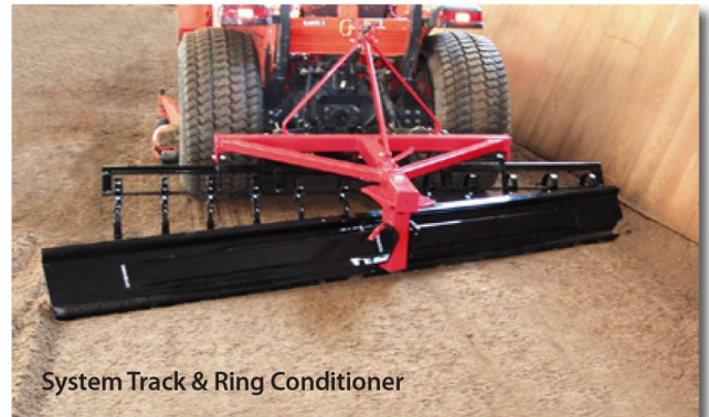
System Track & Ring Conditioner