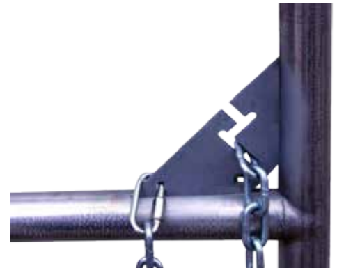
Built-in chain latch plate